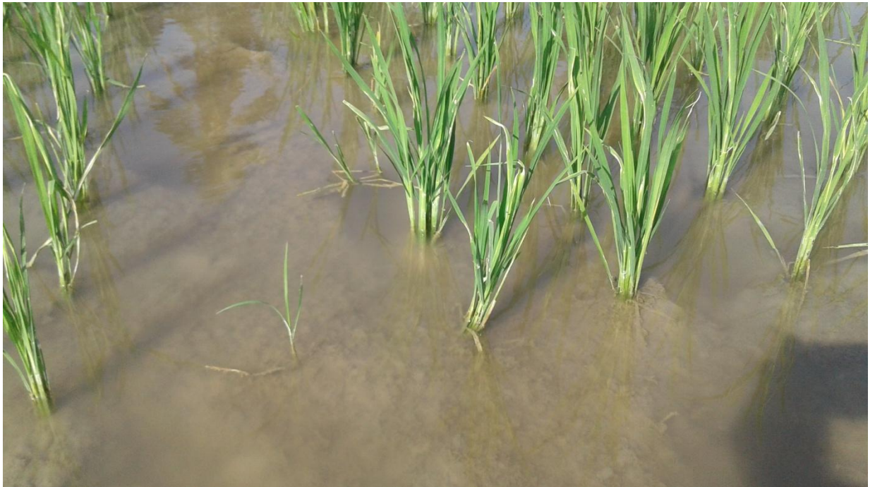
Whorl maggot damage on transplanted paddy